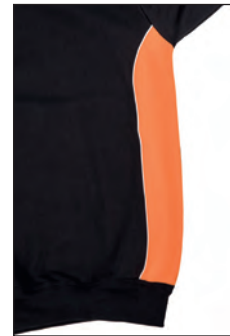
Piping laterali in contrasto