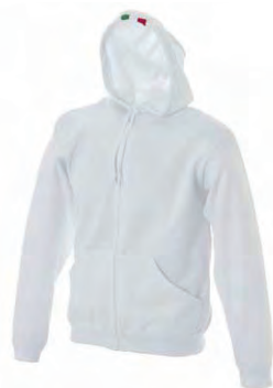
WHITE 989285 details GREEN-WHITE-RED