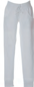
WHITE 990695 details WHITE