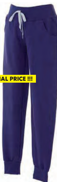
VIOLET 989639 100% cotton