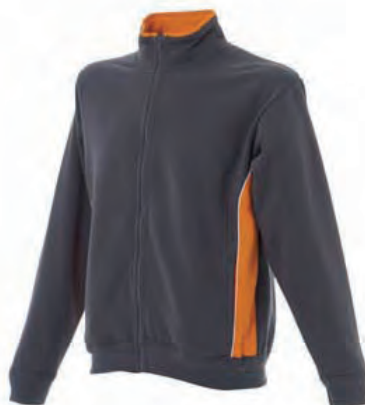
GREY/ORANGE 989608 details WHITE