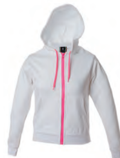
WHITE 990195 details FUCSIA FLUO