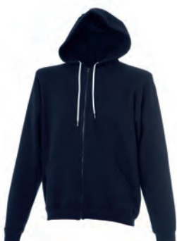
NAVY 990650 details WHITE