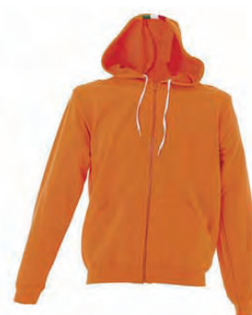
ORANGE 989287 details GREEN-WHITE-RED