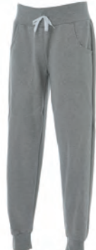
MELANGE 990681 details WHITE