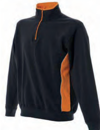
BLACK/ORANGE 989553 details WHITE