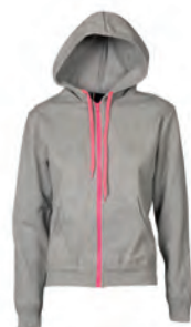
MELANGE 990191 details FUCSIA FLUO