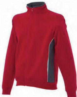
RED/GREY 989604 details WHITE