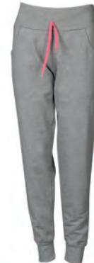
MELANGE 990221 details FUCSIA FLUO