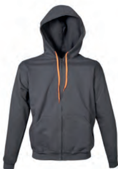
GREY 990658 details ORANGE FLUO