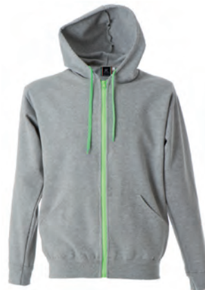
MELANGE 990171 details GREEN FLUO