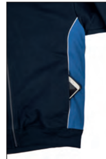
Due tasche a filetto, piping laterali in contrasto