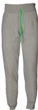
MELANGE 990201 details GREEN FLUO