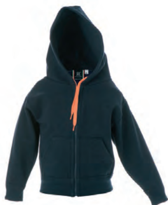
NAVY 990670 details ORANGE FLUO