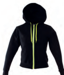
BLACK 990193 details YELLOW FLUO