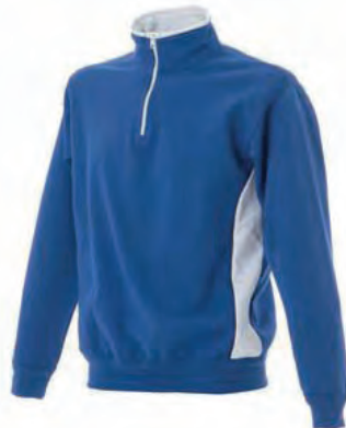
ROYAL/WHITE 989552 details NAVY