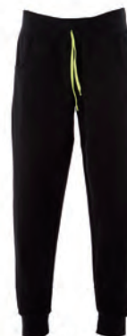
BLACK 990203 details YELLOW FLUO