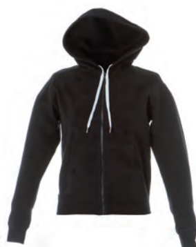
BLACK 990663 details WHITE