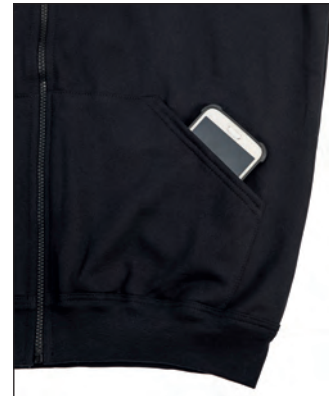
Due tasche a marsupio