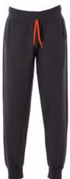
GREY 990688 details ORANGE FLUO