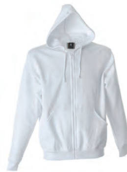
WHITE 990655 details WHITE