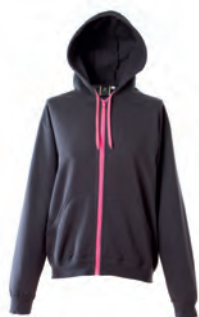
GREY 990198 details FUCSIA FLUO