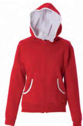
RED 989584 details WHITE