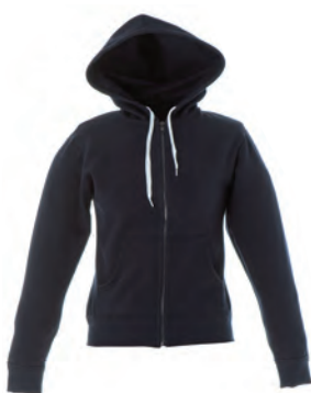
NAVY 990660 details WHITE