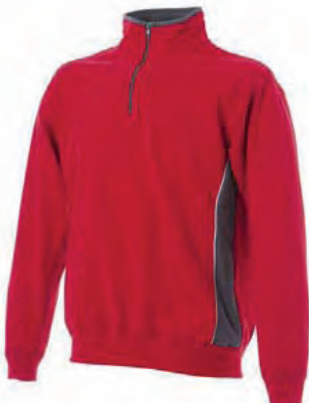
RED/GREY 989554 details WHITE