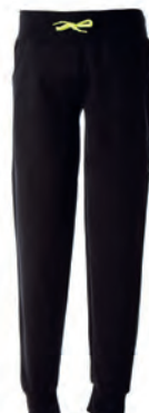
BLACK 990223 details YELLOW FLUO