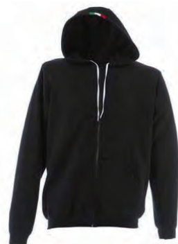
BLACK 989283 details GREEN-WHITE-RED