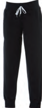
BLACK 990683 details WHITE