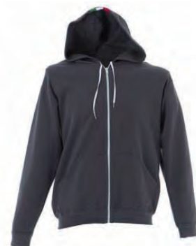
GREY 989288 details GREEN-WHITE-RED