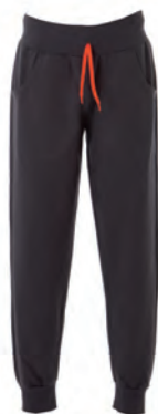
GREY 990209 details ORANGE FLUO