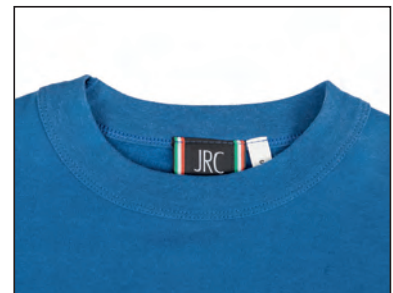
Girocollo in costina