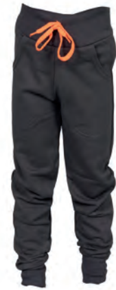
GREY 990708 details ORANGE FLUO