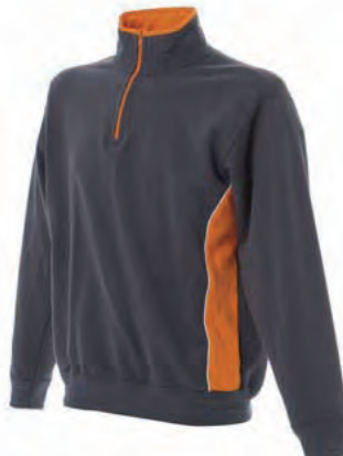
GREY/ORANGE 989558 details WHITE