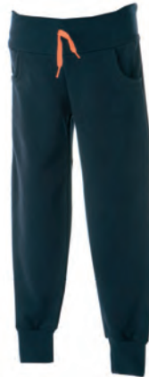
NAVY 990700 details ORANGE FLUO