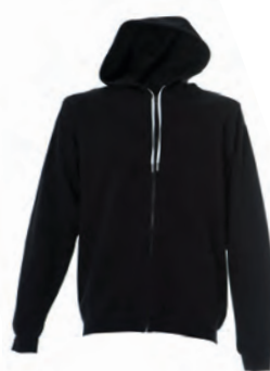
BLACK 990653 details WHITE