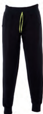
NAVY 990200 details YELLOW FLUO