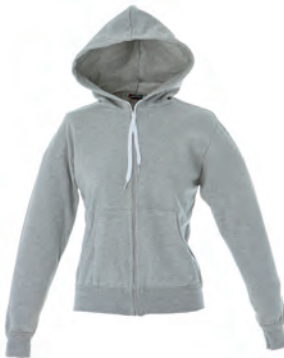
MELANGE 990661 details WHITE