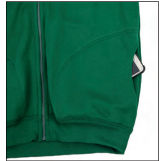
Due tasche a filetto