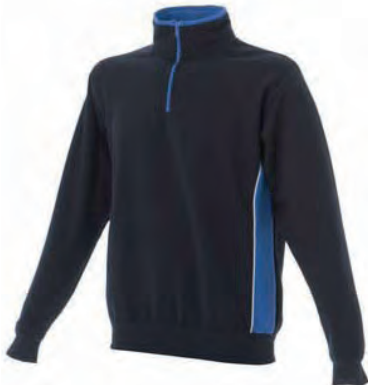
NAVY/ROYAL 989550 details WHITE