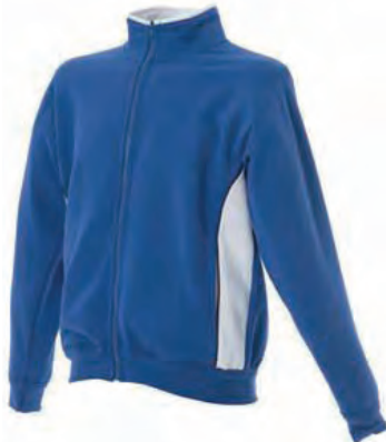
ROYAL/WHITE 989602 details NAVY