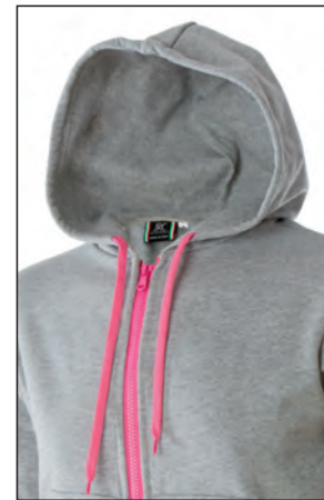
Cappuccio con cordini fluo