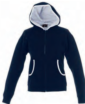
NAVY 989580 details WHITE