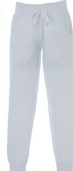
WHITE 990685 details WHITE