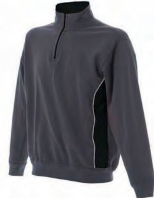
GREY/BLACK 989559 details WHITE