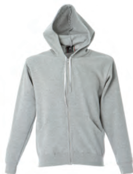
MELANGE 990651 details WHITE