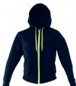
NAVY 990190 details YELLOW FLUO