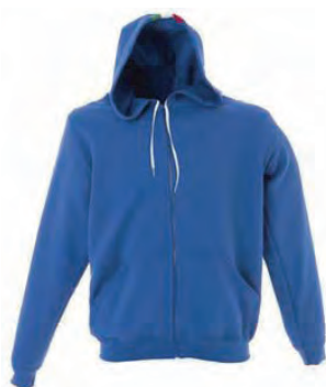
ROYAL 989282 details GREEN-WHITE-RED