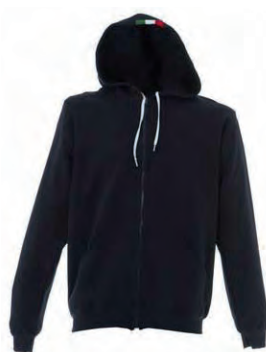
NAVY 989280 details GREEN-WHITE-RED