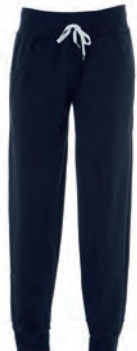
NAVY 990680 details WHITE