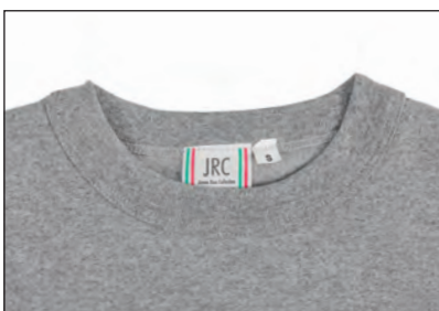
Girocollo in costina