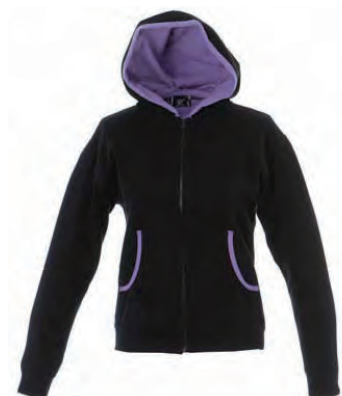
BLACK 989583 details LIGHT VIOLET