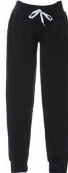
BLACK 990693 details WHITE