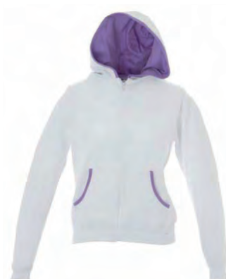
WHITE 989585 details LIGHT VIOLET