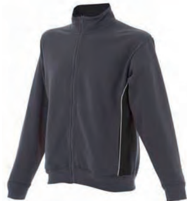
GREY/BLACK 989609 details WHITE