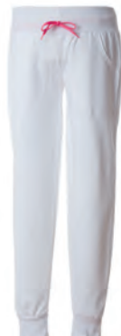
WHITE 990225 details FUCSIA FLUO