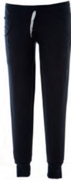
NAVY 990690 details WHITE