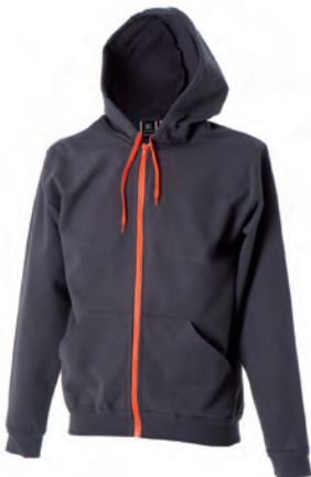
GREY 990178 details ORANGE FLUO