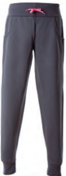
GREY 990698 details FUCSIA FLUO