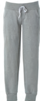
MELANGE 990691 details WHITE