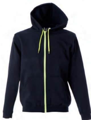
NAVY 990170 details YELLOW FLUO