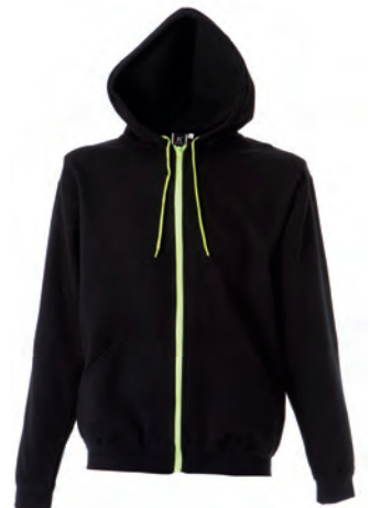
BLACK 990173 details YELLOW FLUO