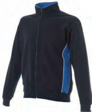
NAVY/ROYAL 989600 details WHITE