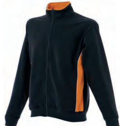
BLACK/ORANGE 989603 details WHITE