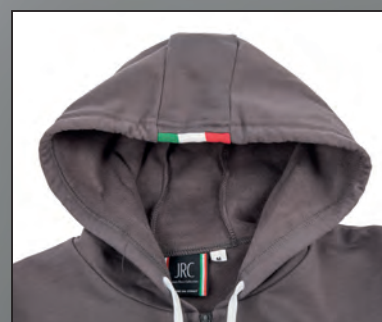
Cappuccio con dettaglio tricolore