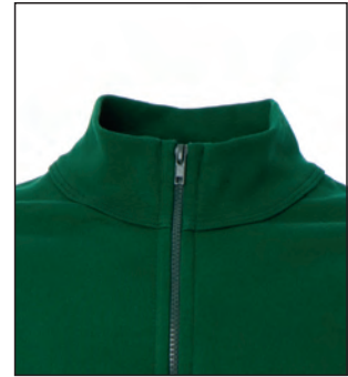
Collo a lupetto in costina