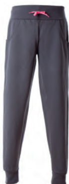
GREY 990229 details FUCSIA FLUO