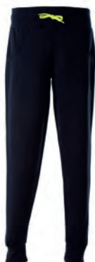
NAVY 990220 details YELLOW FLUO