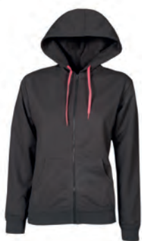
GREY 990668 details FUCSIA FLUO