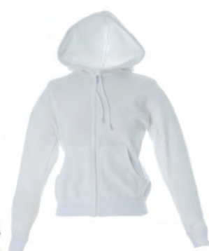
WHITE 990665 details WHITE