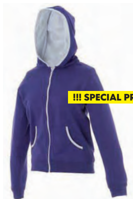
VIOLET 989589 details WHITE