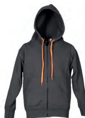
GREY 990678 details ORANGE FLUO